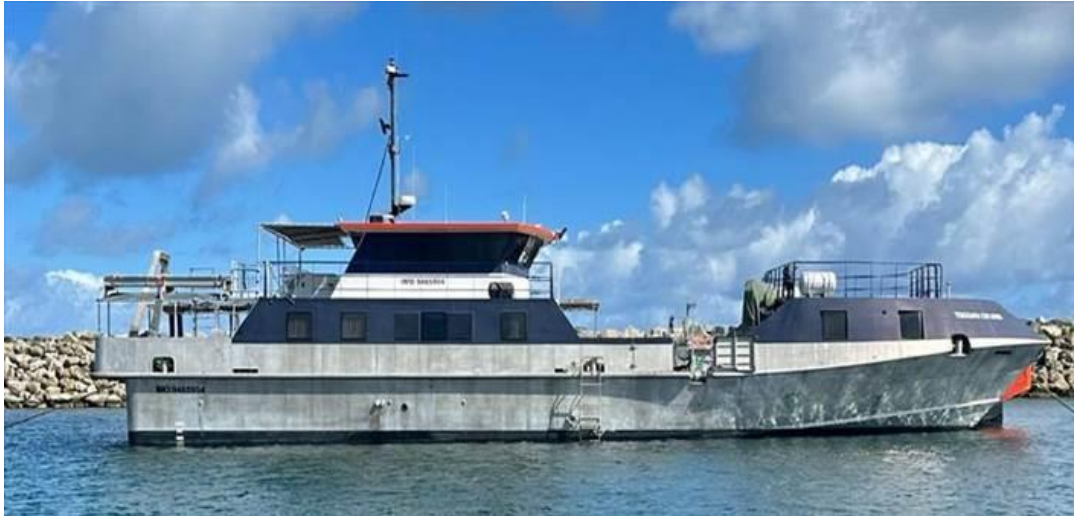
Photo of survey vessel 'Tengarra Explorer'